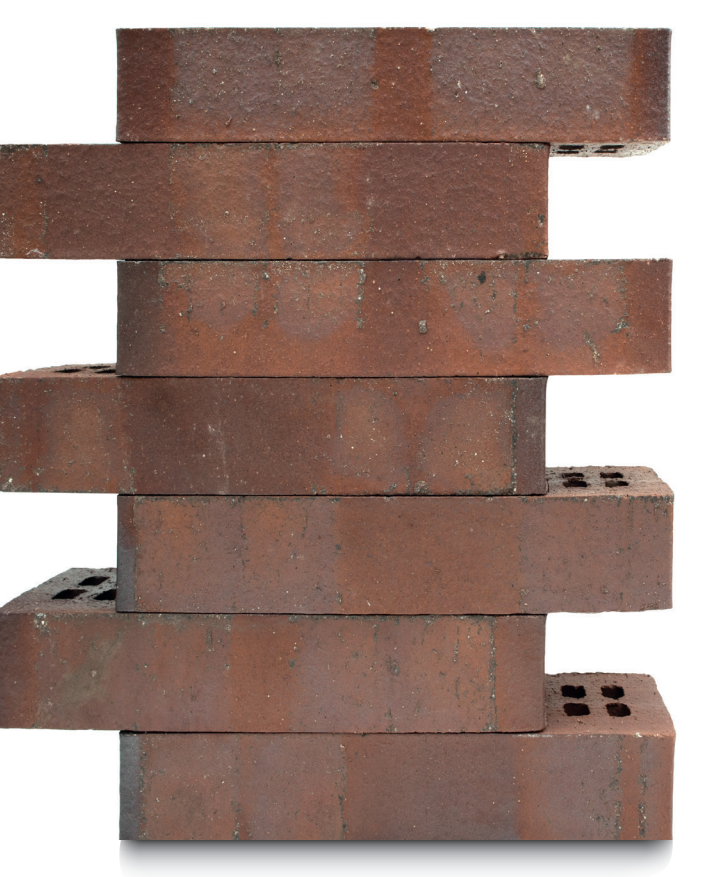
Brick size shown above is 290 x 90 x 52mm